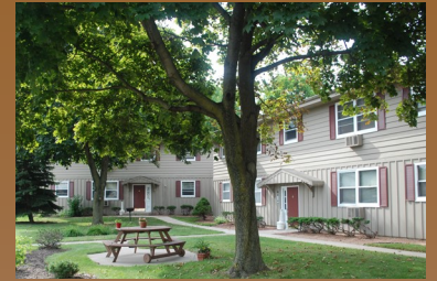
The sixteen units of Northland Pines were a significant acquisition in 2015 and part of 23 units purchased, renovated, or constructed last year.