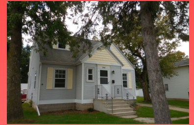
1940 Deckner Avenue was one three renovated homes sold in 2016 and one of eight units rehabbed or built last year.